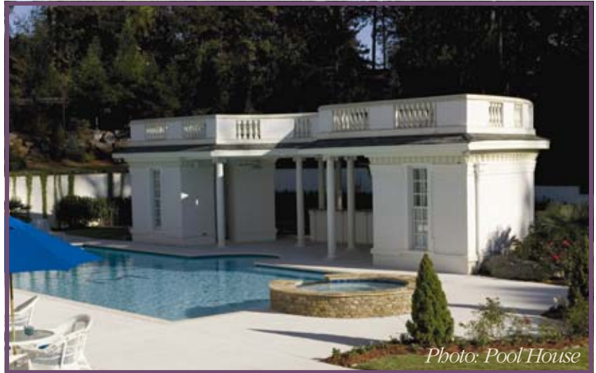
Photo: Pool House