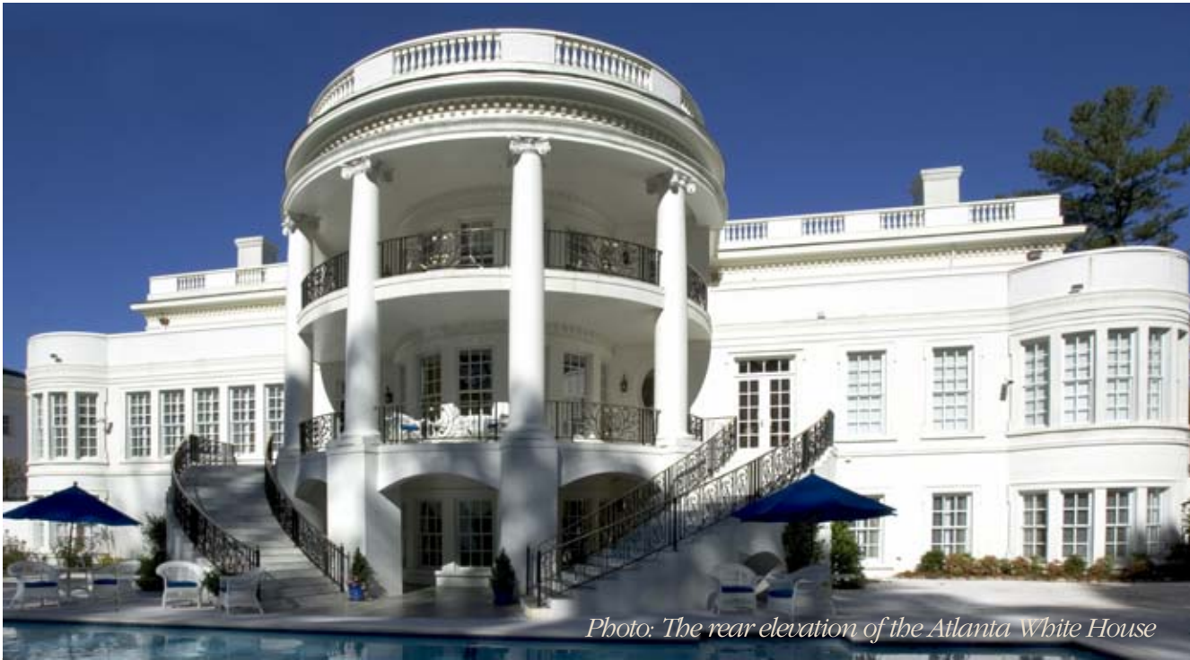
Photo: The rear elevation of the Atlanta White House