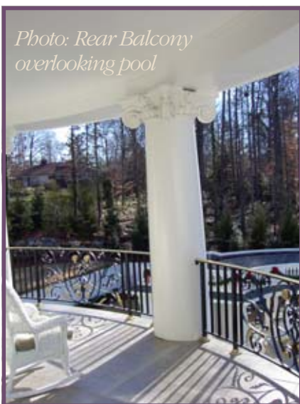
Photo: Rear Balcony overlooking pool