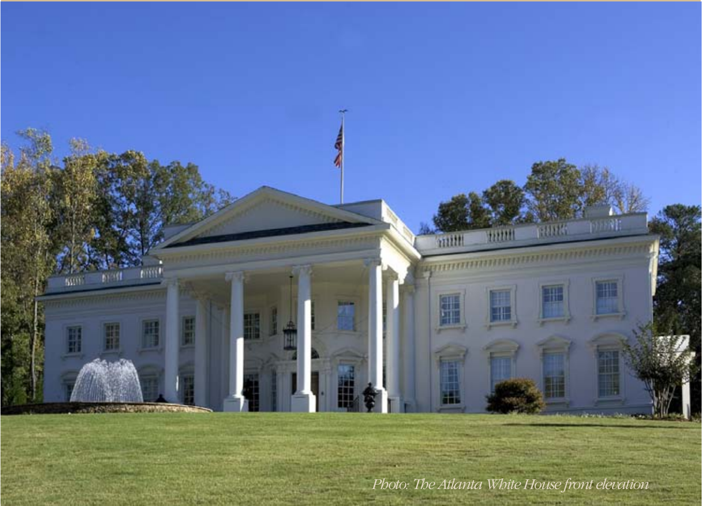
Photo: The Atlanta White House front elevation