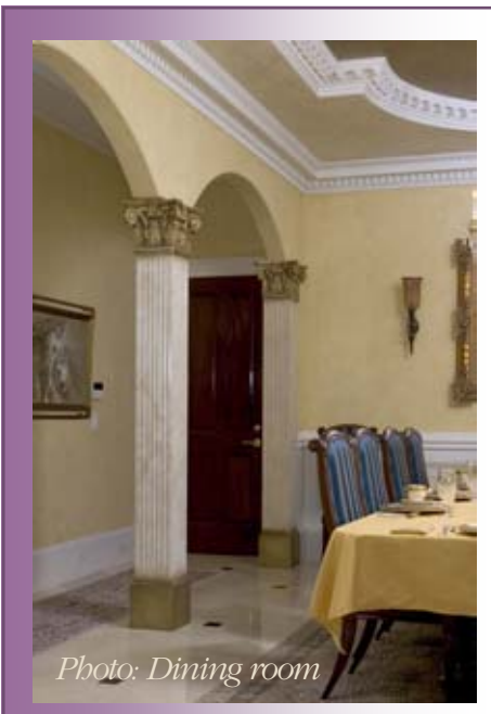
Photo: Dining room